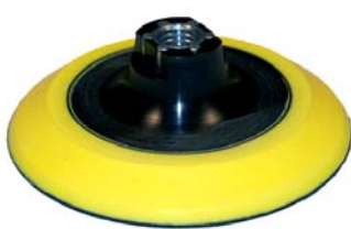
640, 641, & 642 Style

Koltec cushioned pads for PSA adhesive back and glue-on discs are designed for tools with straight rotation, not dual action. They have a sturdy back plate with female 5/8-11 threaded arbor. They can be adapted to fit other power tool shafts with our adapters shown on Page 12. PSA pads have a blue vinyl surface and glue disk pads have a canvas surface.