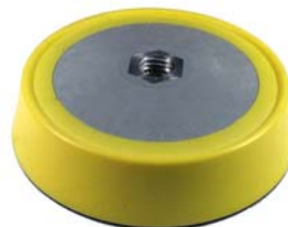
Thick Edge Style