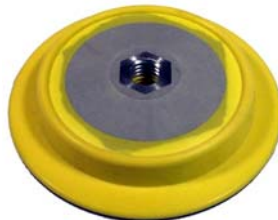
Soft Edge Style