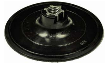
Pads without foam layer for firmer action. Available with or without water hole.