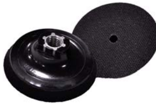
Pads with foam interlayer and a water feed hole. Can be used wet or dry.