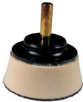
Spindle pads with 1/4" shank